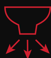
AUTOMATIC PULSE CLEANING